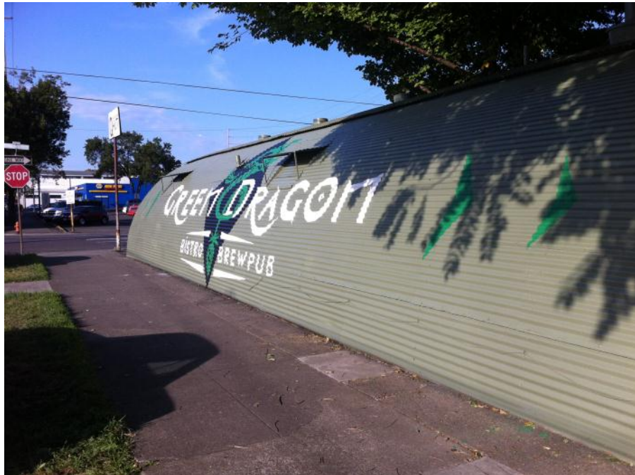
The Green Dragon Bistro and Brewpub home to Buckman Brewery who brews a mean Black Saison.