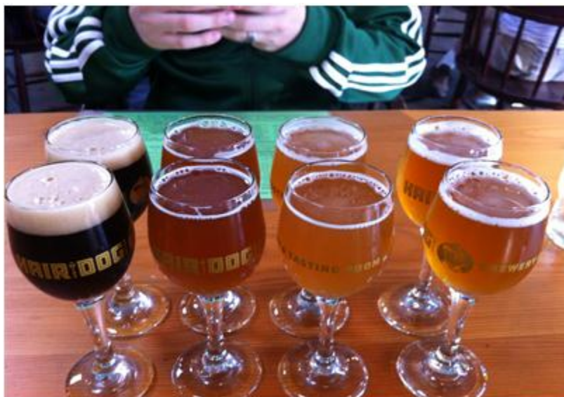
Better yet, Get a taster then you'll get to experience everything!