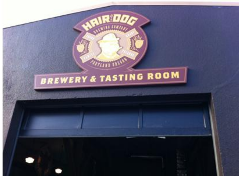
Hair of the Dog, You have to stop in and grab a glass of their Fred or Adam beers!