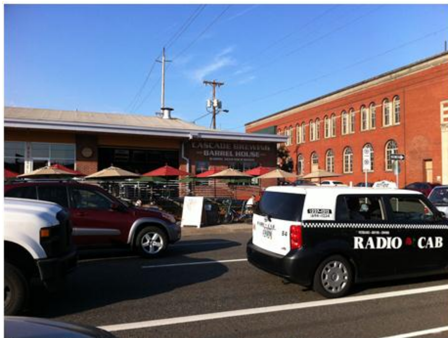
Cascade Brewing and Barrel House, home of the best sour beers I know of.