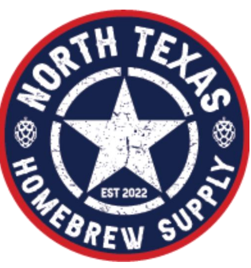
North Texas Homebrew Supply