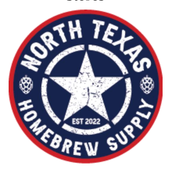
North Texas Homebrew Supply